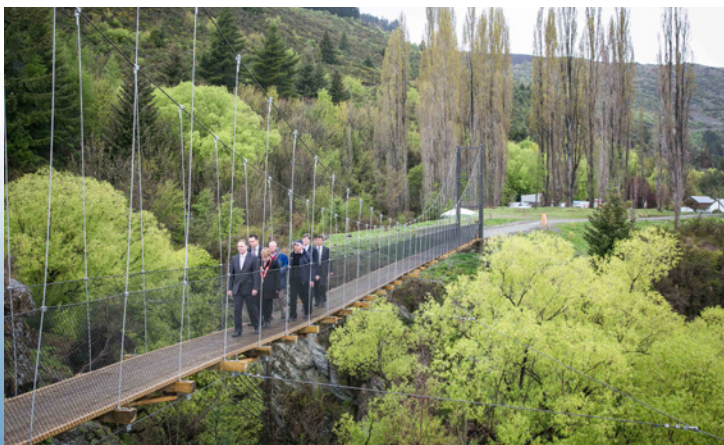
VIP's walking across the Southern Discoveries Bridge, led by Prime Minister John Key at the opening of the Queenstown Trail.