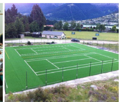
Kelvin Peninsula Tennis Courts