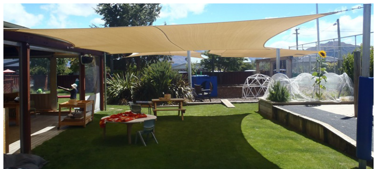
Aspiring Beginnings Learning Centre, Wanaka