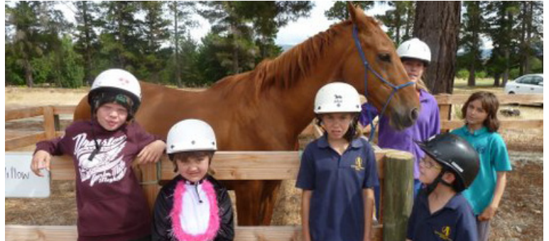
Central Otago Riding for the Disabled