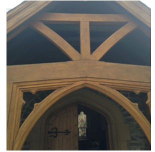
St Peter's Anglican Church, Queenstown