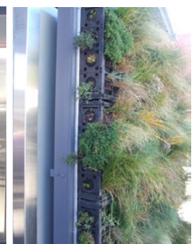
Living Wall, Metal Art - Roxburgh Toilets