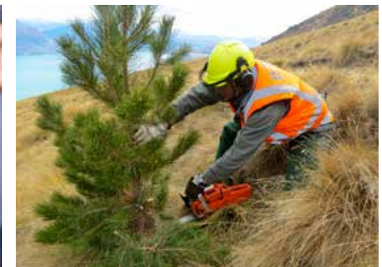
Central Otago Wilding Conifer Control Group