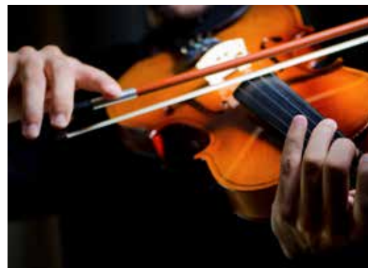
Central Lakes Trust Arts Support Scheme