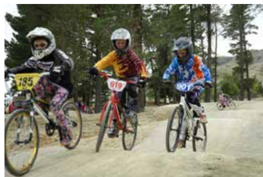
Work completed in 2016 - Cromwell Bike Park