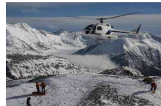
Wanaka Search and Rescue