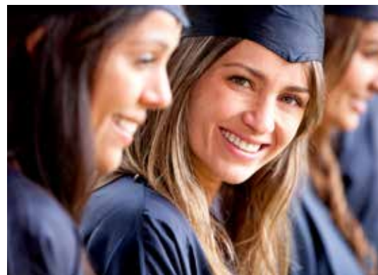
Central Lakes Trust Tertiary Scholarships