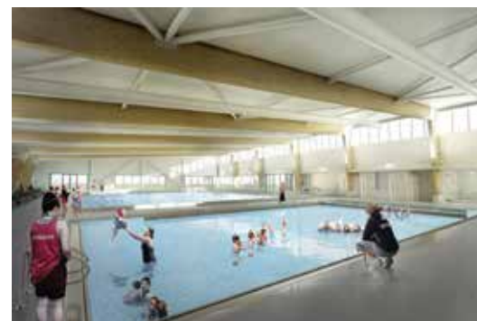
QLDC Wanaka Pool